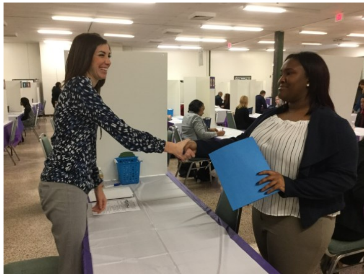
Seniors met with prospective employers during mock interviews and resume reviews.

The E2O program, a collaboration with Richmond Public Schools, Communities in Schools and Goodwill, connects students to resources, skills and opportunities needed for future economic success.